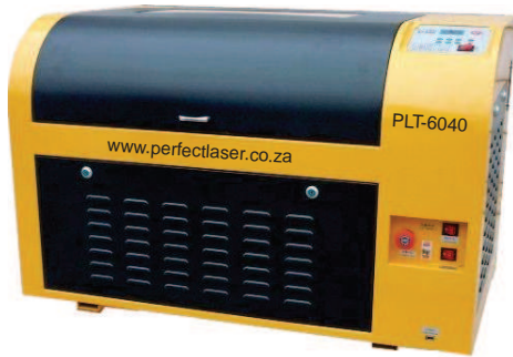
PLT-6040 Turbo 80W

Also, we have found that the water pump supplied with the PLT-6040 TURBO and XTREME is not powerful enough, and on the same service call, we will replace the water pump with a high-performance pump at no charge.