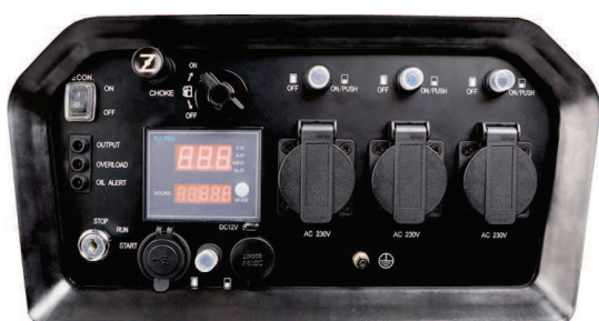
Digital display, electric start.